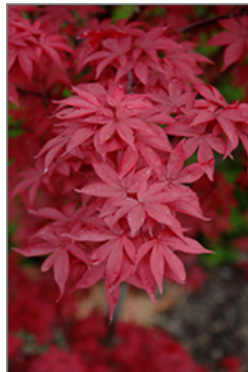
Twombly's Red Sentinel Japanese Maple foliage

Twombly's Red Sentinel Japanese Maple is recommended for the following landscape applications;