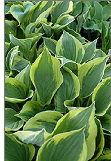
Twilight Hosta foliage

This is a relatively low maintenance plant, and is best cleaned up in early spring before it resumes active growth for the season. Gardeners should be aware of the following characteristic(s) that may warrant special consideration;