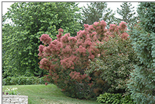
Royal Purple Smokebush in bloom

Royal Purple Smokebush is a multi-stemmed deciduous shrub with an upright spreading habit of growth. Its average texture blends into the landscape, but can be balanced by one or two finer or coarser trees or shrubs for an effective composition.