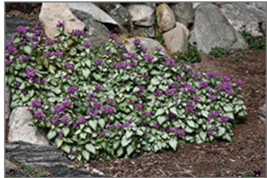
Purple Dragon Spotted Dead Nettle in bloom

We are so proud of the nursery stock that we have carefully selected for superior quality and performance, WE GUARANTEE ALL TREES, SHRUBS, EVERGREENS FOR 2 YEARS, AND ROSES FOR 1 YEAR!