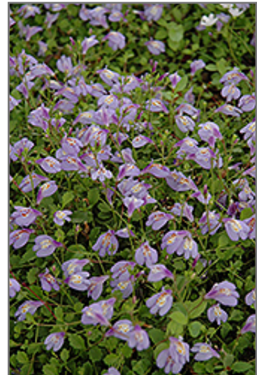
Creeping Mazus flowers

Creeping Mazus is a dense herbaceous evergreen perennial with a ground-hugging habit of growth. Its relatively fine texture sets it apart from other garden plants with less refined foliage.