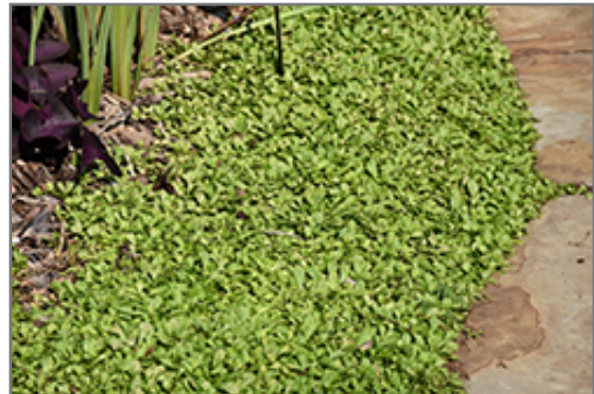
Creeping Mazus