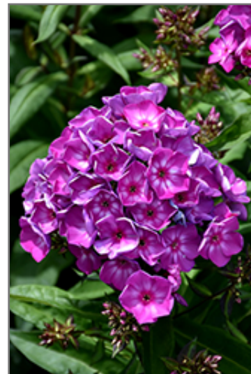
Grape Lollipop Garden Phlox flowers

This plant will require occasional maintenance and upkeep, and should be cut back in late fall in preparation for winter. It is a good choice for attracting butterflies and hummingbirds to your yard. Gardeners should be aware of the following characteristic(s) that may warrant special consideration;