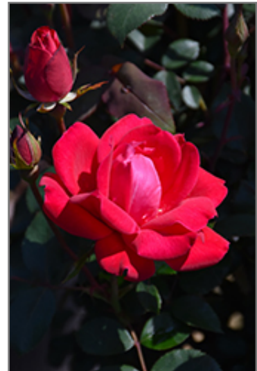
Double Knock Out Rose flowers