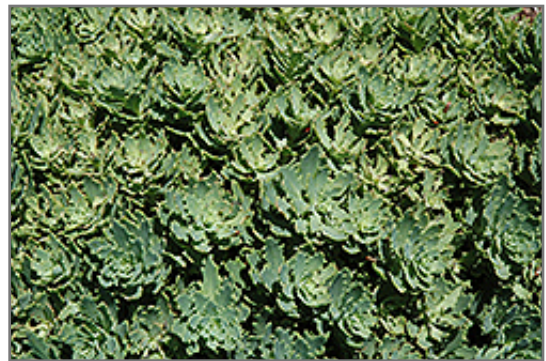
Thundercloud Stonecrop

We are so proud of the nursery stock that we have carefully selected for superior quality and performance, WE GUARANTEE ALL TREES, SHRUBS, EVERGREENS FOR 2 YEARS, AND ROSES FOR 1 YEAR!