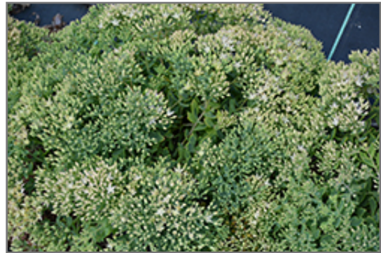
Thundercloud Stonecrop flower buds