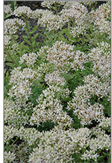
Thundercloud Stonecrop flowers

Thundercloud Stonecrop is a dense herbaceous perennial with a mounded form. Its relatively fine texture sets it apart from other garden plants with less refined foliage.