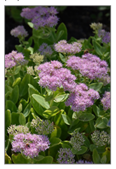
Crystal Pink Stonecrop flowers

Crystal Pink Stonecrop has masses of beautiful clusters of shell pink flowers at the ends of the stems from mid summer to late fall, which emerge from distinctive coral-pink flower buds, and which are most effective when planted in groupings. The flowers are excellent for cutting. Its large succulent round leaves remain light green in color throughout the season. The dark red stems are very colorful and add to the overall interest of the plant.