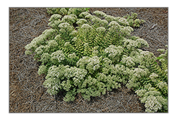
Crystal Pink Stonecrop in bloom