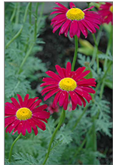
Robinson's Red Painted Daisy flowers

We are so proud of the nursery stock that we have carefully selected for superior quality and performance, WE GUARANTEE ALL TREES, SHRUBS, EVERGREENS FOR 2 YEARS, AND ROSES FOR 1 YEAR!