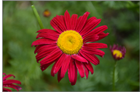
Robinson's Red Painted Daisy flowers

Robinson's Red Painted Daisy is an herbaceous perennial with a mounded form. Its relatively fine texture sets it apart from other garden plants with less refined foliage.