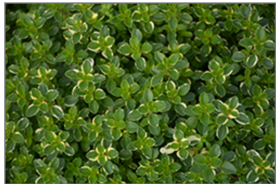
Variegated Broadleaf Thyme foliage

We are so proud of the nursery stock that we have carefully selected for superior quality and performance, WE GUARANTEE ALL TREES, SHRUBS, EVERGREENS FOR 2 YEARS, AND ROSES FOR 1 YEAR!