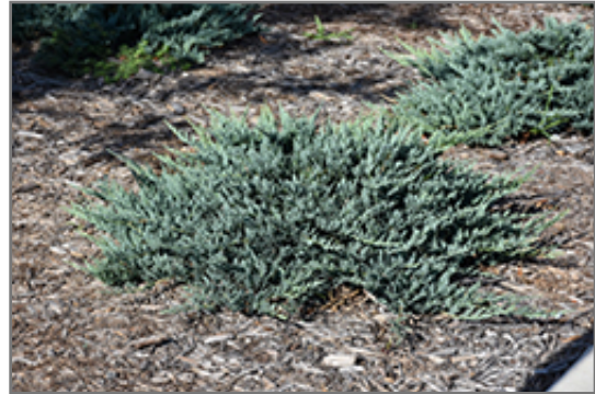
Blue Chip Juniper

Blue Chip Juniper is recommended for the following landscape applications;