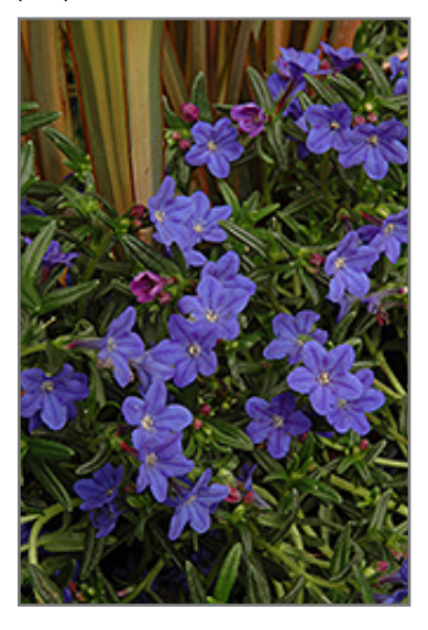
Grace Ward Lithodora in bloom

Grace Ward Lithodora is recommended for the following landscape applications;