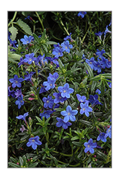
Grace Ward Lithodora flowers