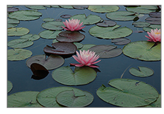
Attraction Hardy Water Lily flowers

Attraction Hardy Water Lily is recommended for the following landscape applications;