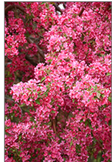
Prairifire Flowering Crab flowers

We are so proud of the nursery stock that we have carefully selected for superior quality and performance, WE GUARANTEE ALL TREES, SHRUBS, EVERGREENS FOR 2 YEARS, AND ROSES FOR 1 YEAR!