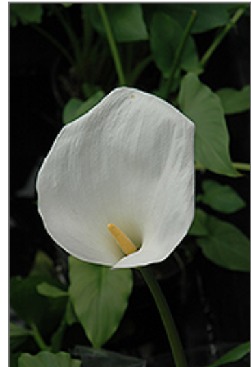
Calla Lily flowers

Calla Lily is recommended for the following landscape applications;