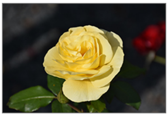
High Voltage Rose flowers