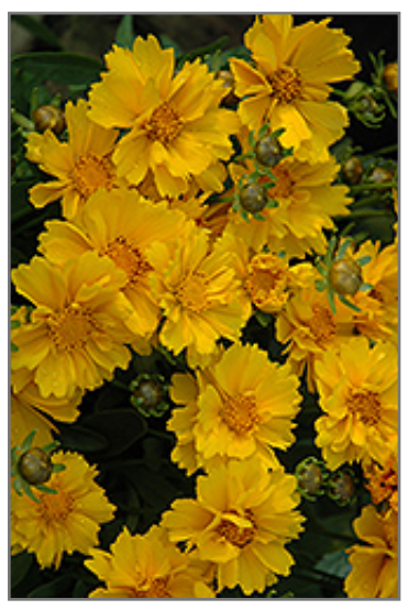
Presto Dwarf Tickseed flowers

Presto Dwarf Tickseed is smothered in stunning semi-double yellow daisy flowers with gold eyes at the ends of the stems from early to late summer. The flowers are excellent for cutting. Its narrow leaves remain emerald green in color throughout the season.