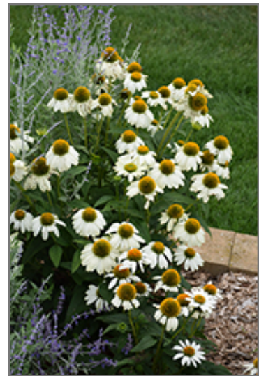
PowWow White Coneflower in bloom

We are so proud of the nursery stock that we have carefully selected for superior quality and performance, WE GUARANTEE ALL TREES, SHRUBS, EVERGREENS FOR 2 YEARS, AND ROSES FOR 1 YEAR!