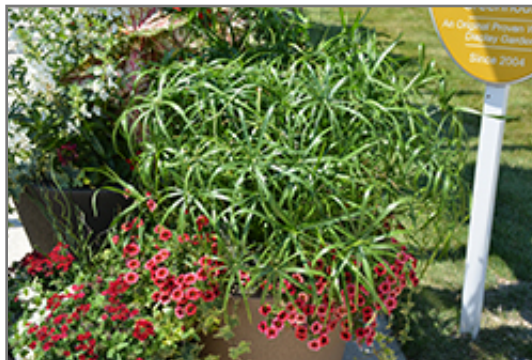
Baby Tut Umbrella Grass

Baby Tut Umbrella Grass is recommended for the following landscape applications;