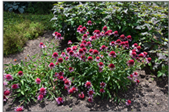
Double Scoop Bubble Gum Coneflower in bloom

We are so proud of the nursery stock that we have carefully selected for superior quality and performance, WE GUARANTEE ALL TREES, SHRUBS, EVERGREENS FOR 2 YEARS, AND ROSES FOR 1 YEAR!