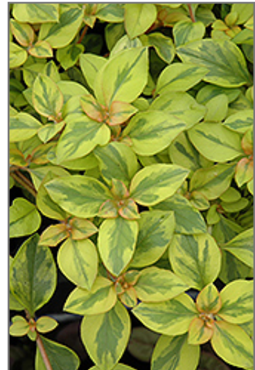
Walkabout Sunset Loosestrife foliage