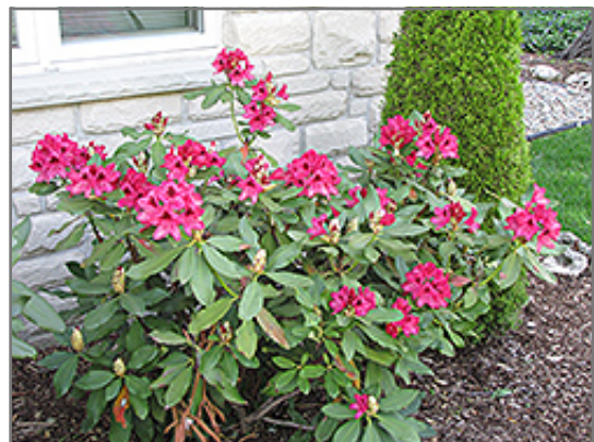
Nova Zembla Rhododendron in bloom

We are so proud of the nursery stock that we have carefully selected for superior quality and performance, WE GUARANTEE ALL TREES, SHRUBS, EVERGREENS FOR 2 YEARS, AND ROSES FOR 1 YEAR!