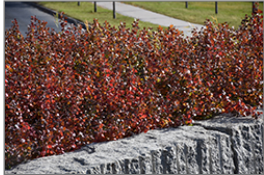
Gro-Low Fragrant Sumac in fall

Gro-Low Fragrant Sumac will grow to be about 24 inches tall at maturity, with a spread of 7 feet. It has a low canopy. It grows at a slow rate, and under ideal conditions can be expected to live for approximately 25 years.