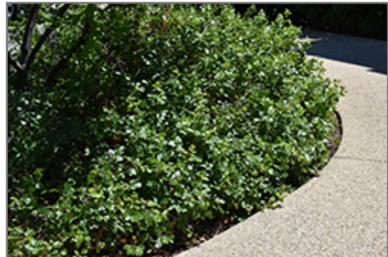
Gro-Low Fragrant Sumac