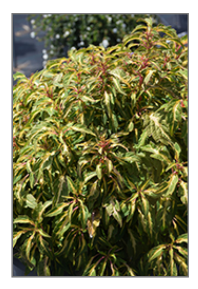
ColorBlaze Alligator Tears Coleus foliage

We are so proud of the nursery stock that we have carefully selected for superior quality and performance, WE GUARANTEE ALL TREES, SHRUBS, EVERGREENS FOR 2 YEARS, AND ROSES FOR 1 YEAR!