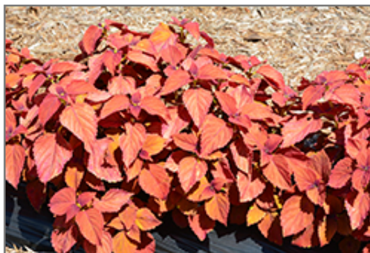
ColorBlaze Sedona Sunset Coleus