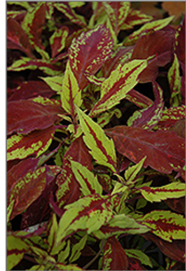
Pineapple Coleus foliage

Pineapple Coleus is recommended for the following landscape applications;