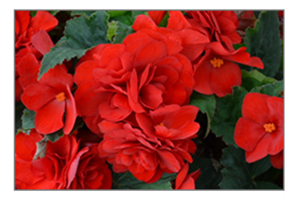
Nonstop Deep Red Begonia flowers

Nonstop Deep Red Begonia features dainty double ruby-red frilly flowers at the ends of the stems from mid spring to mid fall. Its succulent heart-shaped leaves remain green in color throughout the season.