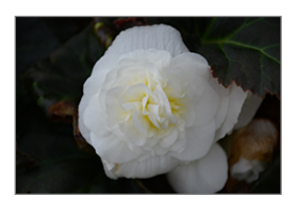
Nonstop Mocca White Begonia flowers