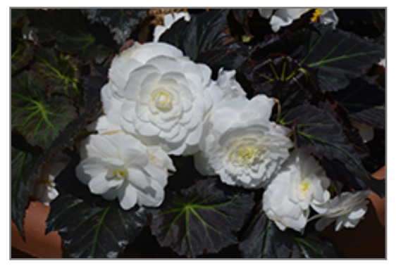
Nonstop Mocca White Begonia flowers

Nonstop Mocca White Begonia features dainty double white frilly flowers with lemon yellow centers at the ends of the stems from mid spring to mid fall. Its succulent heart-shaped leaves remain green in color throughout the season.