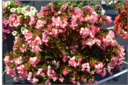
BabyWing Pink Begonia in bloom