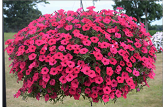
Supertunia Vista Fuchsia Petunia in bloom

We are so proud of the nursery stock that we have carefully selected for superior quality and performance, WE GUARANTEE ALL TREES, SHRUBS, EVERGREENS FOR 2 YEARS, AND ROSES FOR 1 YEAR!