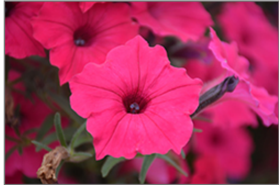
Supertunia Vista Fuchsia Petunia flowers

Supertunia Vista Fuchsia Petunia is recommended for the following landscape applications;