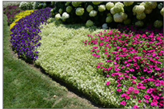
Frosty Knight Alyssum in bloom