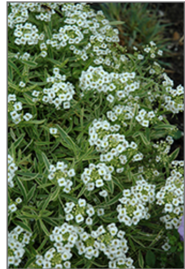
Frosty Knight Alyssum flowers

Frosty Knight Alyssum is a dense herbaceous annual with a trailing habit of growth, eventually spilling over the edges of hanging baskets and containers. It brings an extremely fine and delicate texture to the garden composition and should be used to full effect.