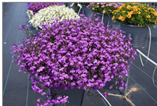
Techno Violet Lobelia in bloom

We are so proud of the nursery stock that we have carefully selected for superior quality and performance, WE GUARANTEE ALL TREES, SHRUBS, EVERGREENS FOR 2 YEARS, AND ROSES FOR 1 YEAR!