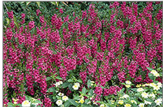
Archangel Dark Rose Angelonia in bloom

We are so proud of the nursery stock that we have carefully selected for superior quality and performance, WE GUARANTEE ALL TREES, SHRUBS, EVERGREENS FOR 2 YEARS, AND ROSES FOR 1 YEAR!