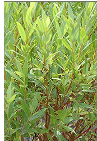
Flame Willow foliage

We are so proud of the nursery stock that we have carefully selected for superior quality and performance, WE GUARANTEE ALL TREES, SHRUBS, EVERGREENS FOR 2 YEARS, AND ROSES FOR 1 YEAR!