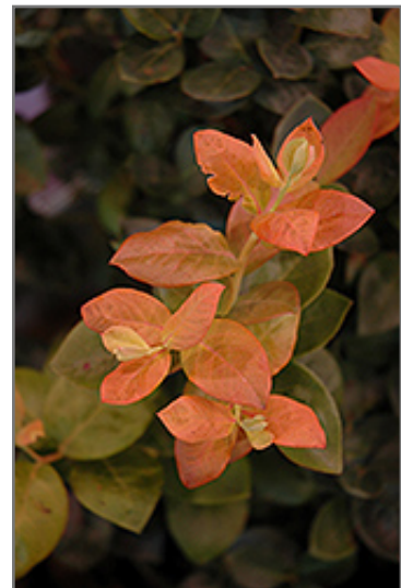
Peach Sorbet Blueberry foliage

We are so proud of the nursery stock that we have carefully selected for superior quality and performance, WE GUARANTEE ALL TREES, SHRUBS, EVERGREENS FOR 2 YEARS, AND ROSES FOR 1 YEAR!