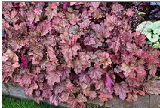
Carnival Watermelon Coral Bells in bloom