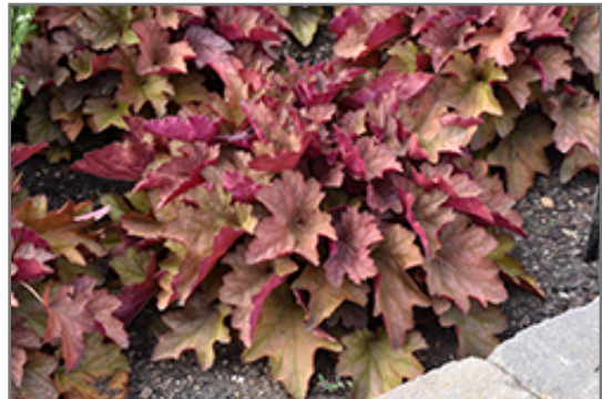
Carnival Watermelon Coral Bells

Carnival Watermelon Coral Bells is a dense herbaceous evergreen perennial with tall flower stalks held atop a low mound of foliage. Its relatively fine texture sets it apart from other garden plants with less refined foliage.