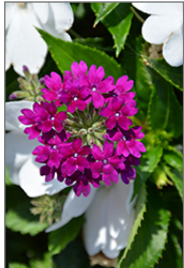
Superbena Royale Plum Wine Verbena flowers

We are so proud of the nursery stock that we have carefully selected for superior quality and performance, WE GUARANTEE ALL TREES, SHRUBS, EVERGREENS FOR 2 YEARS, AND ROSES FOR 1 YEAR!