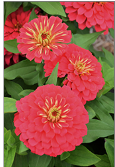
Magellan Coral Zinnia flowers

Magellan Coral Zinnia is recommended for the following landscape applications;