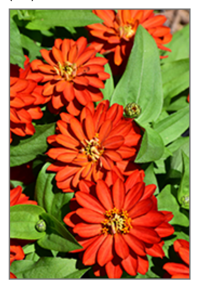
Zahara Double Fire Zinnia flowers