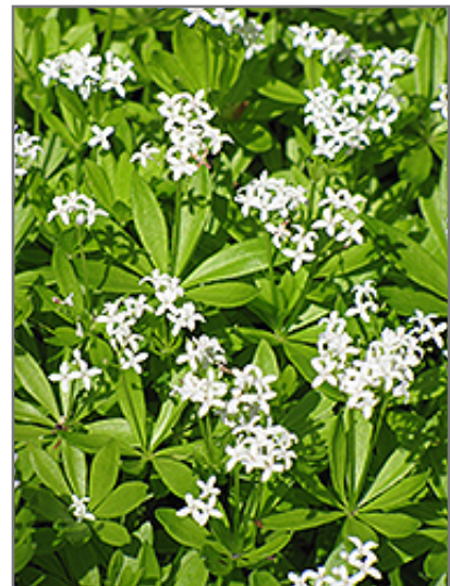
Sweet Woodruff flowers

We are so proud of the nursery stock that we have carefully selected for superior quality and performance, WE GUARANTEE ALL TREES, SHRUBS, EVERGREENS FOR 2 YEARS, AND ROSES FOR 1 YEAR!