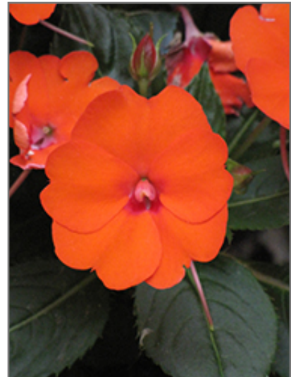
SunPatens Compact Electric Orange New Guinea Impatiens flowers

SunPatens Compact Electric Orange New Guinea Impatiens is a dense herbaceous annual with a mounded form. Its medium texture blends into the garden, but can always be balanced by a couple of finer or coarser plants for an effective composition.