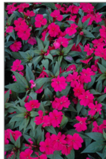
SunPatens Compact Royal Magenta New Guinea Impatiens flowers

We are so proud of the nursery stock that we have carefully selected for superior quality and performance, WE GUARANTEE ALL TREES, SHRUBS, EVERGREENS FOR 2 YEARS, AND ROSES FOR 1 YEAR!