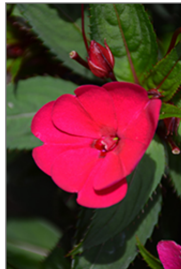
SunPatens Compact Royal Magenta New Guinea Impatiens flowers

SunPatens Compact Royal Magenta New Guinea Impatiens is a dense herbaceous annual with a mounded form. Its medium texture blends into the garden, but can always be balanced by a couple of finer or coarser plants for an effective composition.