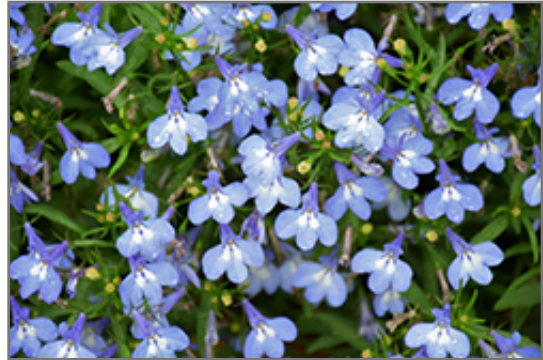
Techno Upright Light Blue Lobelia flowers

Techno Upright Light Blue Lobelia is an herbaceous annual with a trailing habit of growth, eventually spilling over the edges of hanging baskets and containers. It brings an extremely fine and delicate texture to the garden composition and should be used to full effect.