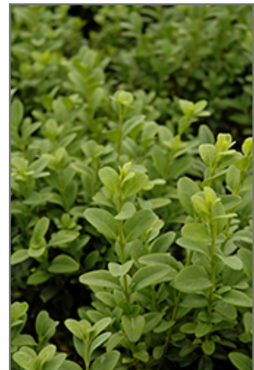
Julia Jane Boxwood foliage

We are so proud of the nursery stock that we have carefully selected for superior quality and performance, WE GUARANTEE ALL TREES, SHRUBS, EVERGREENS FOR 2 YEARS, AND ROSES FOR 1 YEAR!