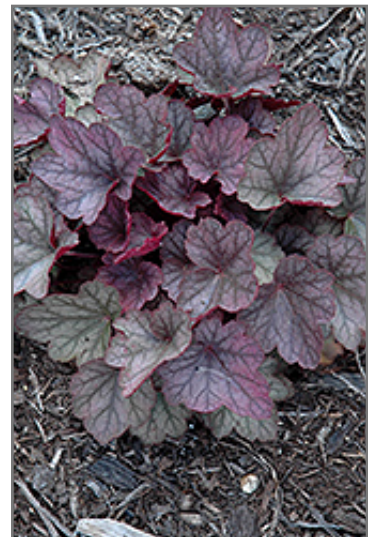
Carnival Rose Granita Coral Bells foliage

We are so proud of the nursery stock that we have carefully selected for superior quality and performance, WE GUARANTEE ALL TREES, SHRUBS, EVERGREENS FOR 2 YEARS, AND ROSES FOR 1 YEAR!