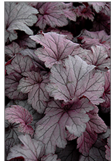
Spellbound Coral Bells foliage

We are so proud of the nursery stock that we have carefully selected for superior quality and performance, WE GUARANTEE ALL TREES, SHRUBS, EVERGREENS FOR 2 YEARS, AND ROSES FOR 1 YEAR!