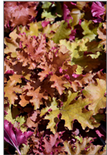
Zipper Coral Bells foliage

Zipper Coral Bells is recommended for the following landscape applications;