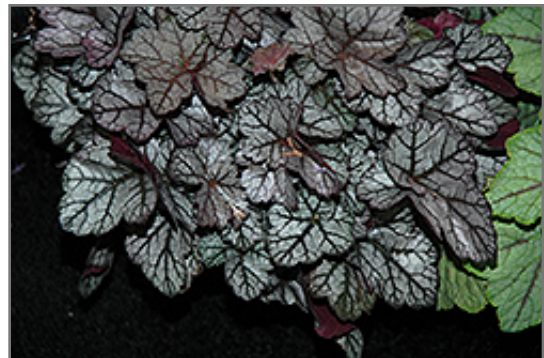
Glitter Coral Bells foliage

We are so proud of the nursery stock that we have carefully selected for superior quality and performance, WE GUARANTEE ALL TREES, SHRUBS, EVERGREENS FOR 2 YEARS, AND ROSES FOR 1 YEAR!