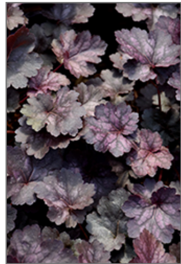
Glitter Coral Bells foliage

We are so proud of the nursery stock that we have carefully selected for superior quality and performance, WE GUARANTEE ALL TREES, SHRUBS, EVERGREENS FOR 2 YEARS, AND ROSES FOR 1 YEAR!