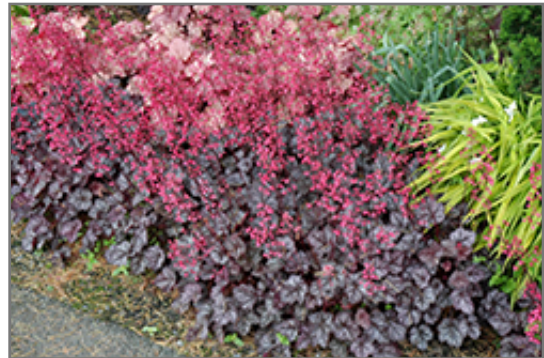
Glitter Coral Bells in bloom

Glitter Coral Bells is a dense herbaceous evergreen perennial with tall flower stalks held atop a low mound of foliage. Its relatively fine texture sets it apart from other garden plants with less refined foliage.