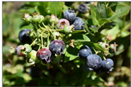
Jelly Bean Blueberry fruit

We are so proud of the nursery stock that we have carefully selected for superior quality and performance, WE GUARANTEE ALL TREES, SHRUBS, EVERGREENS FOR 2 YEARS, AND ROSES FOR 1 YEAR!